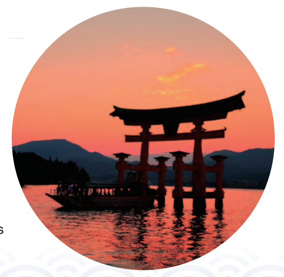
The world heritage Itsukushima shrine